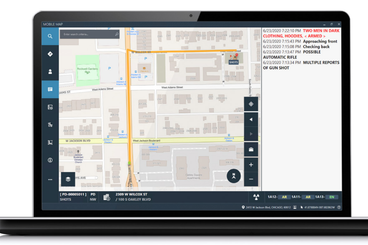
Windows Navigation and Call Comments