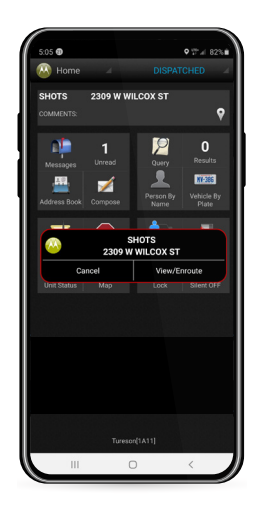
Android Dashboard Dispatch Notification

First responders have access to real-time information from PremierOne CAD, PremierOne Records and local, state and federal databases. Users easily access information they need via a simple, one-step navigation experience throughout the PremierOne Mobile application enabling more informed decisions and quicker, safer, and more efficient resolution.